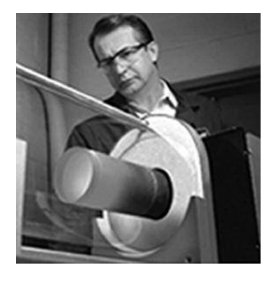
Low Emissions Technology