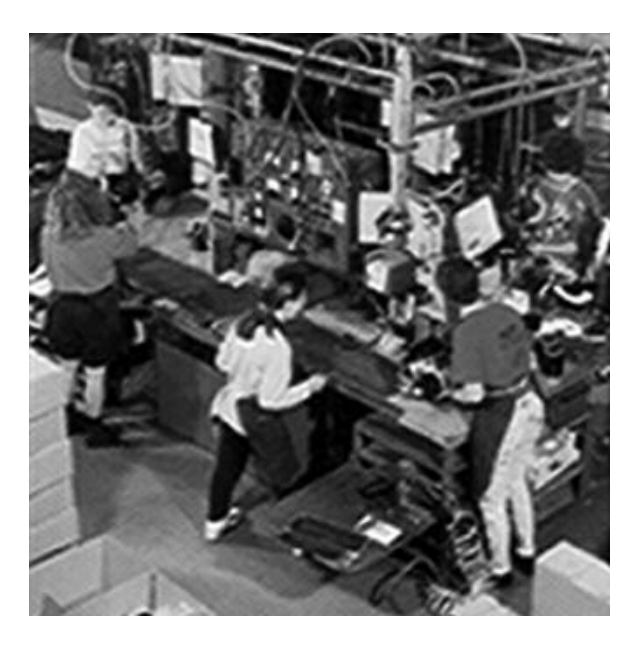
R. W. Beckett Plant

promotion of atheism and where most of the population followed decidedly different standards and norms, the challenge was even greater.