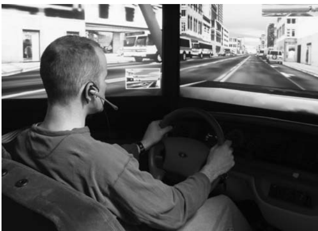
Figure 2. Participant talking on a cell phone in the I-Sim driving simulator.

To determine who initiated the reference to traffic, we analyzed the number of initializations made in the cell phone conversation