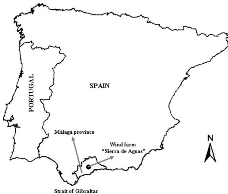
Fig. 1 Location of the study area

Each wind turbine generates 850 KW. Thus, the total power of the wind farm is 13.6 MW. The wind turbines have three blades with variable step. They are made of