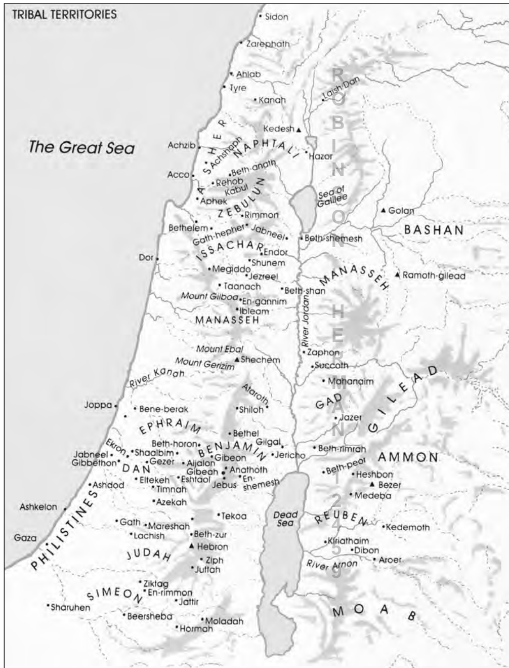
FIGURE 5-1 The division of the land (Josh. 13:1–19:51).