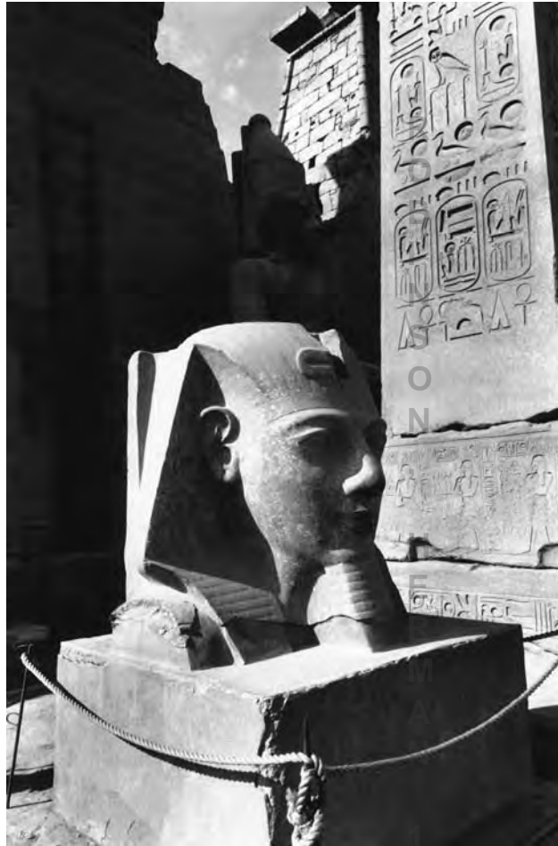
FIGURE 4-1 “The Pharaoh said to (Moses), ‘Get away from me . . . do not see my face again’ ” (Exod. 10:28). This statue is a representation of Ramses II, believed to be the Pharaoh of the Exodus.