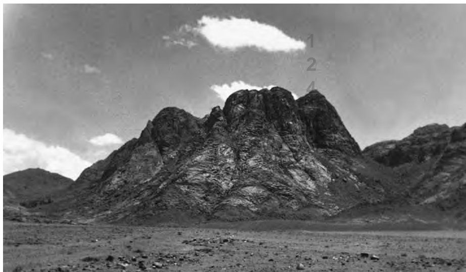
FIGURE 4–3 “On the third new moon after the Israelites had gone out of . . . Egypt . . . they came into the wilderness of Sinai” (Exod. 19:1). Jebel Musa, the traditional site of Mount Sinai, is located in this range of mountains.