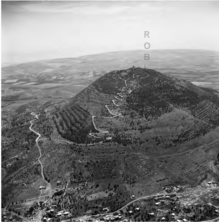
FIGURE 5-2 In Judges 4:6, Deborah sends Barak to prepare his army on Mount Tabor. This photograph shows Mount Tabor today.

The Canaanites, equipped with heavy war chariots (4:3), were drawn up on the level plain, while the ill-equipped Israelites were on the slopes of Mount Tabor. A heavy storm broke. The Kishon River, usually no more than a trickle of water, became a raging torrent. It flooded the plain and turned it into a muddy swamp. The heavy iron chariots, so fearsome on solid ground, became liabilities instead of assets. The Israelites rushed down the mountain and cut the enemy to pieces (4:13–16; 5:19–21).