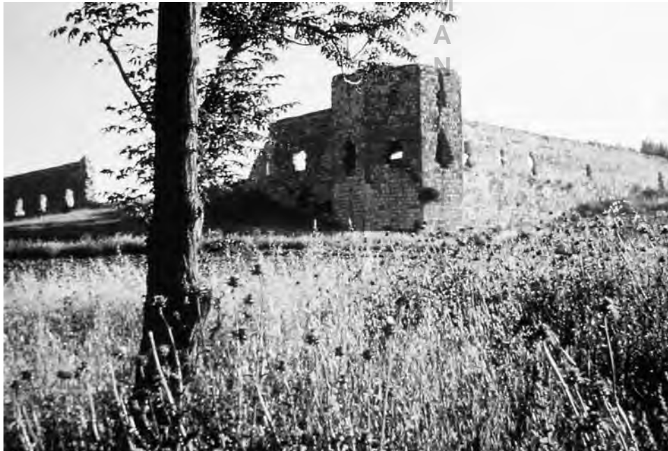
FIGURE 6-1 "[The Israelites] encamped at Ebenezer, and the Philistines encamped at Aphek" (1 Sam. 4:1d). Aphek was a strategic point on the great coastal highway. The remains of a sixteenth-century Turkish fort now occupy much of the site.

The result was a disaster for Israel. The Philistines were inspired to fight harder. Not only did they defeat the Israelites, but they killed Hophni and Phineas and captured the Ark (4:6–11).