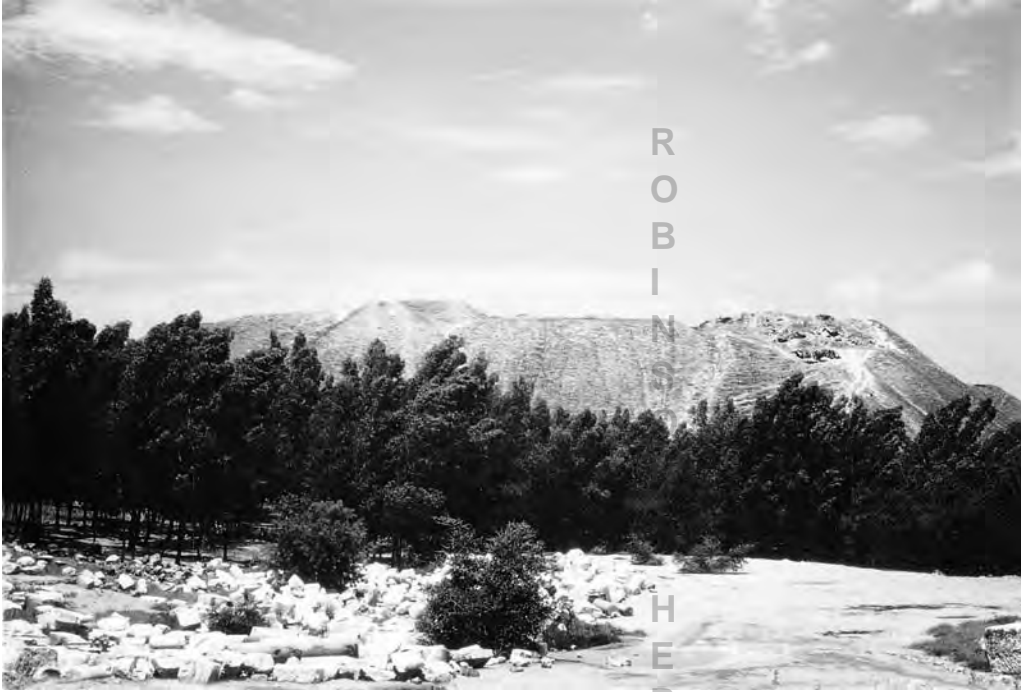
FIGURE 6-2 “They put [Saul’s] armor in the temple of Astarte, and they fastened his body to the wall of Beth-Shan” (1 Sam. 31:10). Tell Beth-Shan, in the valley of Jezreel, was the site of an ancient city that guarded an important crossing of the Jordan.

on them, some of his men did not want to share any of the spoils of battle with those who had stayed behind to guard the camp. David ruled that every man should receive an equal share. Furthermore, he shared the spoils with the elders of Judah (30:7–31).