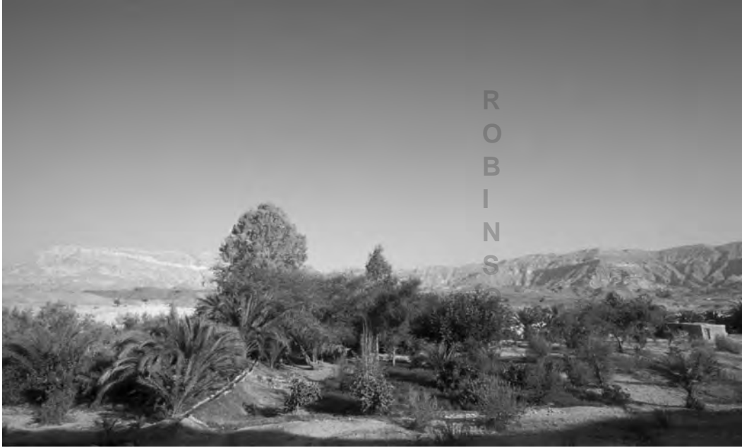
FIGURE 4-4 Exodus 15:27 reports the arrival of the Israelites at an oasis called Elim. This photograph shows a modern oasis in the Sinai region of Egypt.

this famous prophet, but others did also. We now know of Balaam apart from the biblical text through inscriptions that have been found in Transjordan. That this is the same prophet spoken of in Numbers 22–24 is shown by the fact that he is identified in these inscriptions as “Balaam, the son of Beor” (cf. Num. 22:5). The inscriptions also speak of him receiving his oracles at night, as in Numbers 22:8, 19f. Unlike in the Bible, however, he is further described as “seer of the gods,” who speak to him at night. This would indicate that he was by no means an Israelite prophet or a follower of YHWH (the LORD). There is mention also of goddesses, another idea foreign to Israelite religion. As in the biblical account, he is pictured as one who pronounces curses. 24 It is in light of these texts, then, that the Balaam stories in Numbers will be examined.