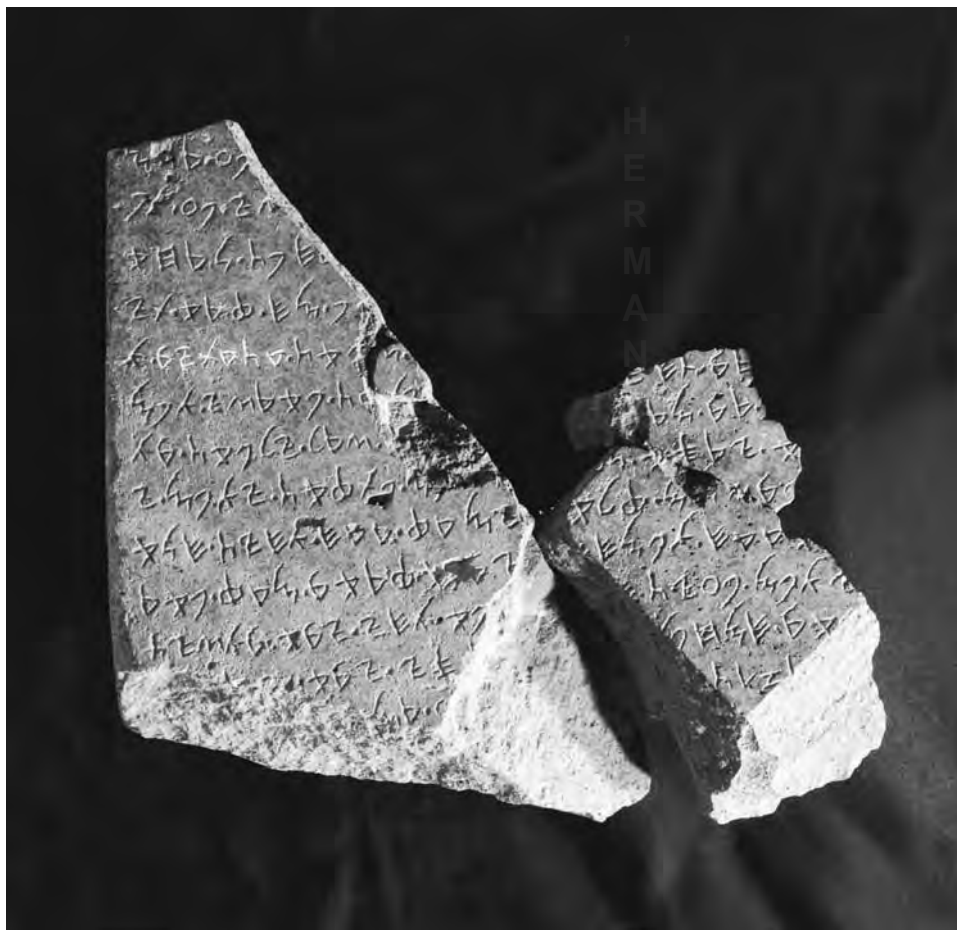
FIGURE 6-3 This inscription, found at Tell Dan in northern Israel, was part of a victory stele or column erected by an Aramean (Syrian) ruler to brag about his success in a battle against the house of David.

He ruled his kingdom well. One reason for this may have been that, when he captured Jerusalem, he captured people who had been trained in Egypt to run the government. Instead of killing them, he put them to work organizing and running his empire. 12