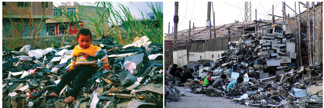
FIGURE 5.5 Photos from Guiyu, China [45]